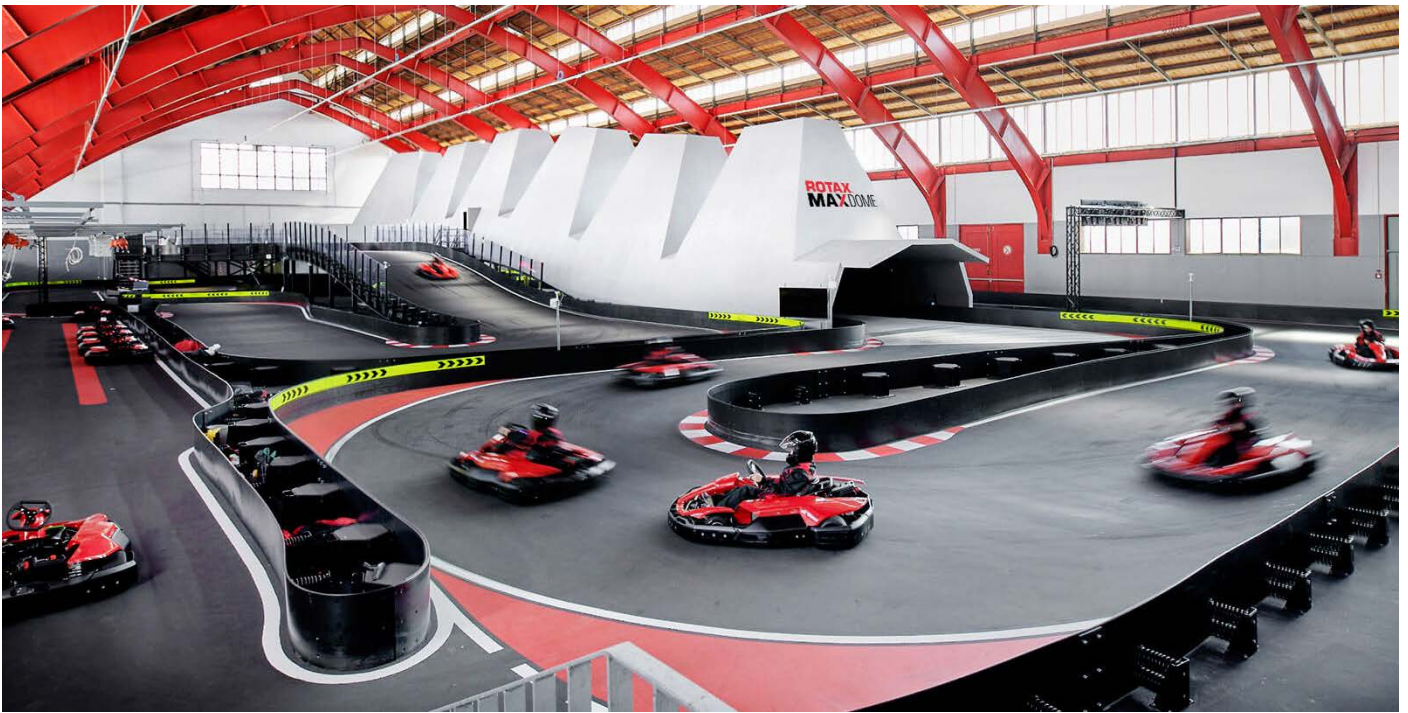
Rotax MAX Dome