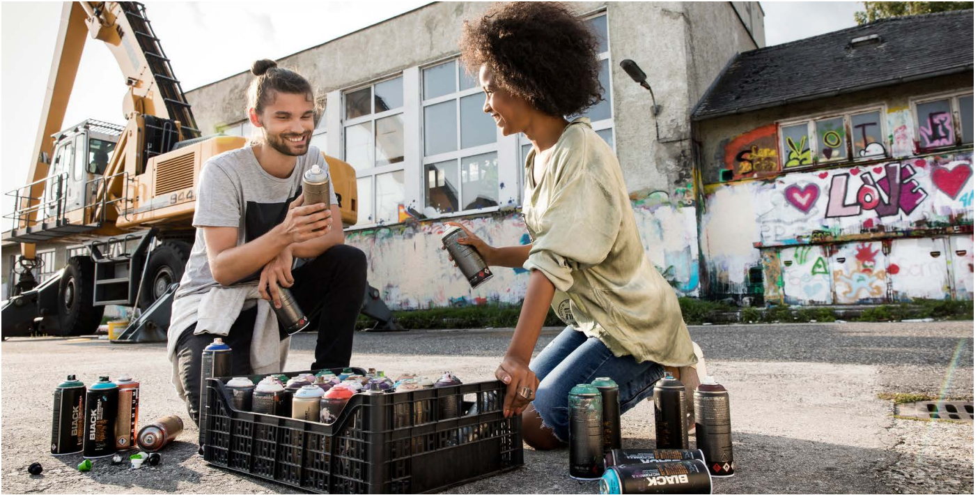
Mural Harbor