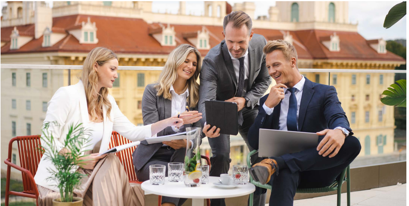
Eventerfolge im historischen Ambiente 1