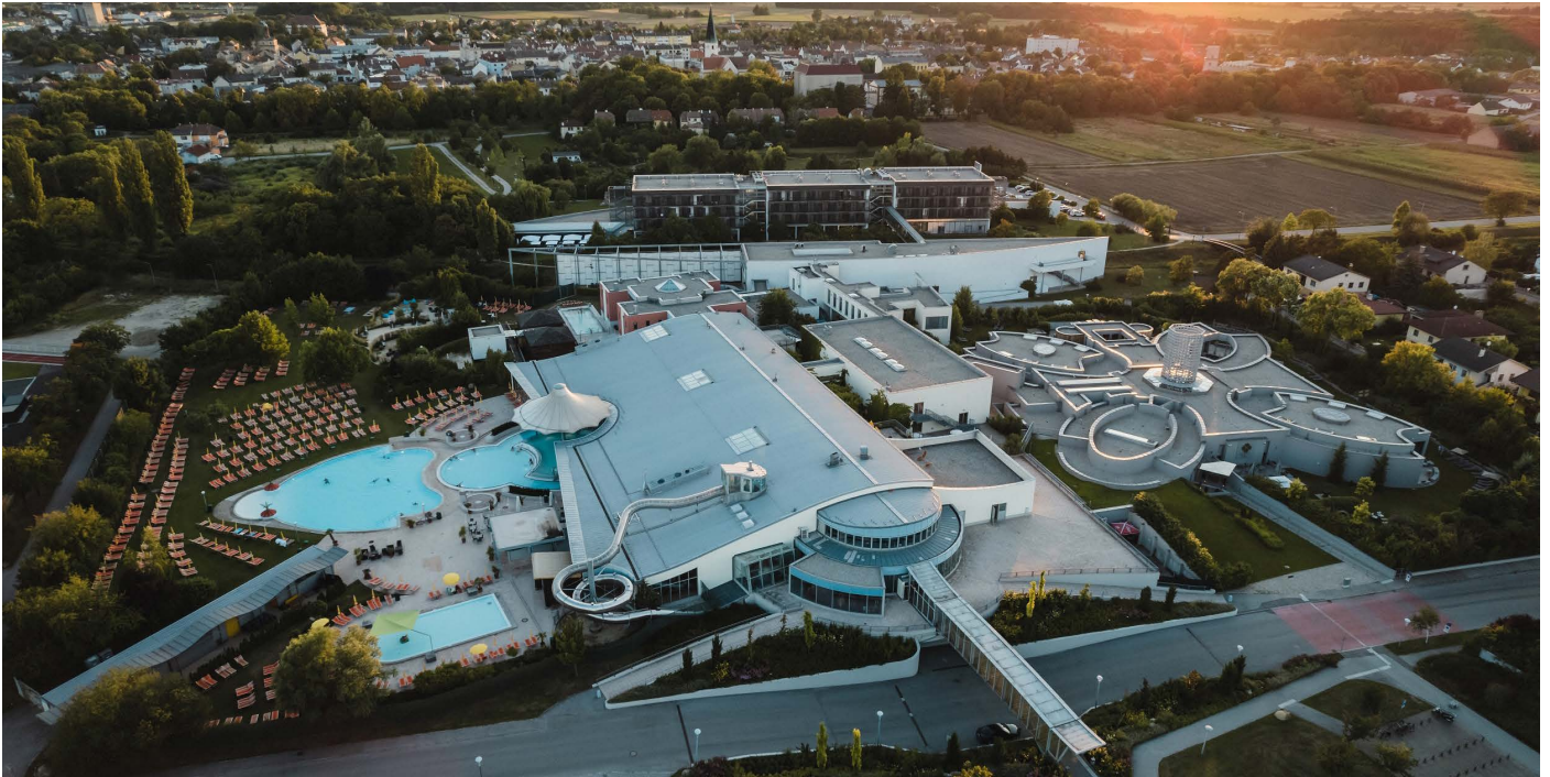
Green meetings in Therme Laa