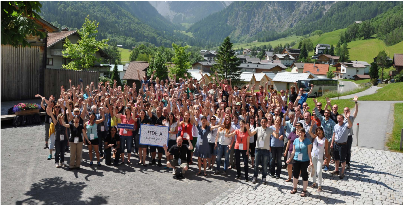
Rent a village in Brand / Vorarlberg