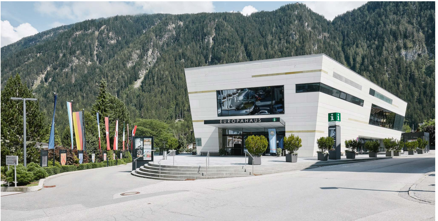
Mayrhofen EuropaHaus