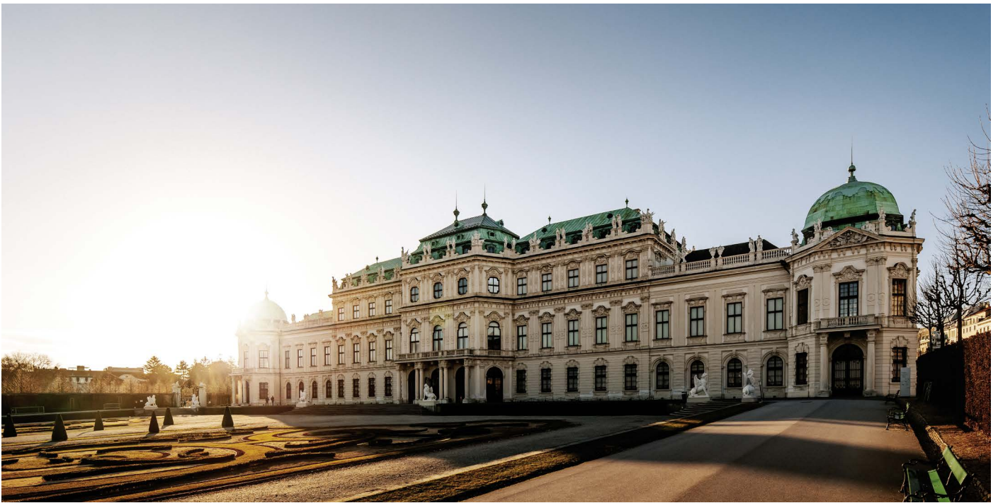
Belvedere Palace