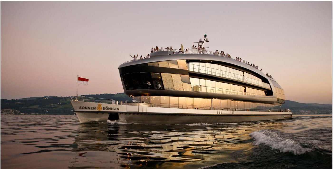
Conference location Sonnenkönigin