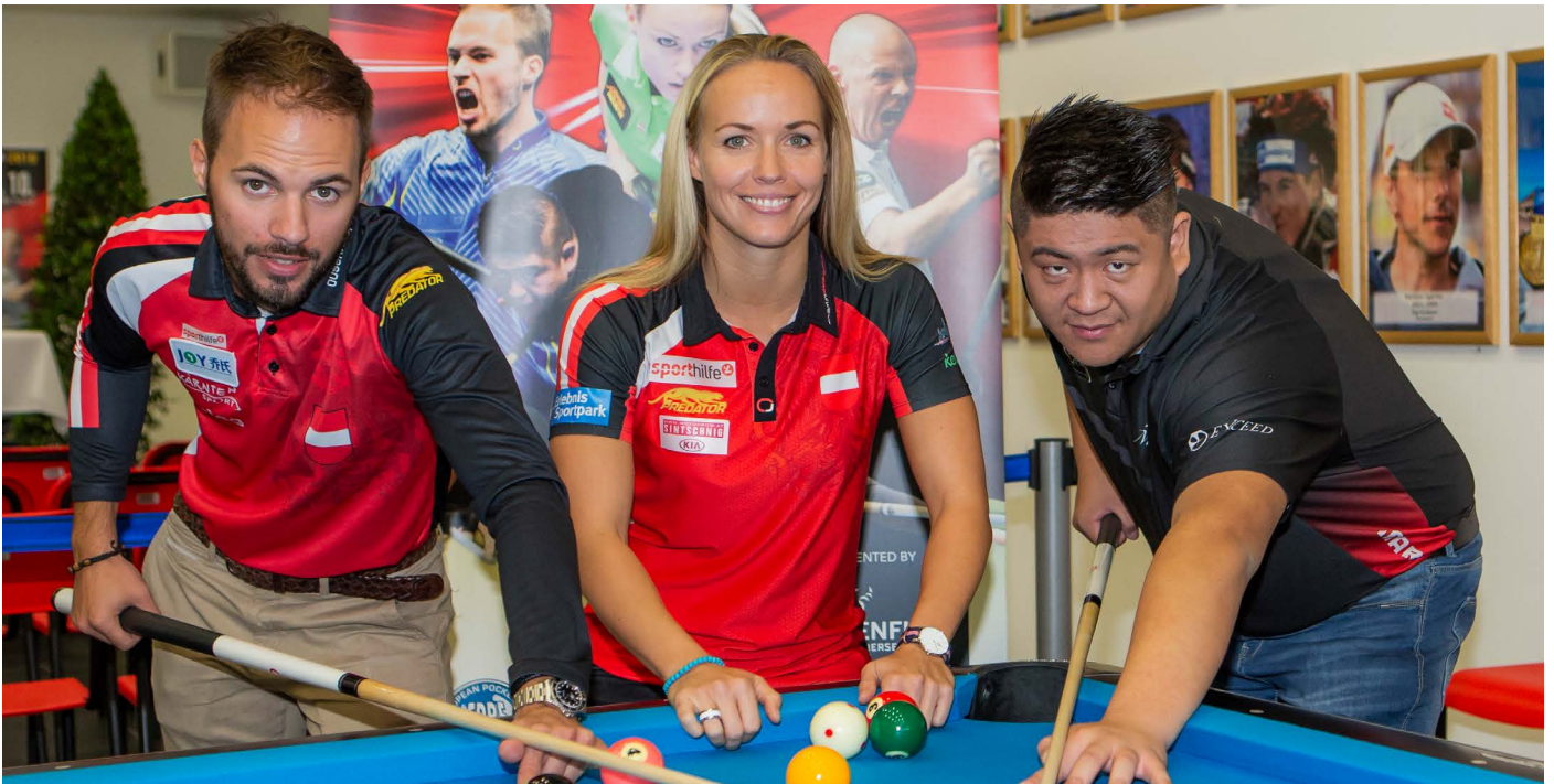
Play Pool with world champion © Jasmin Ouschan