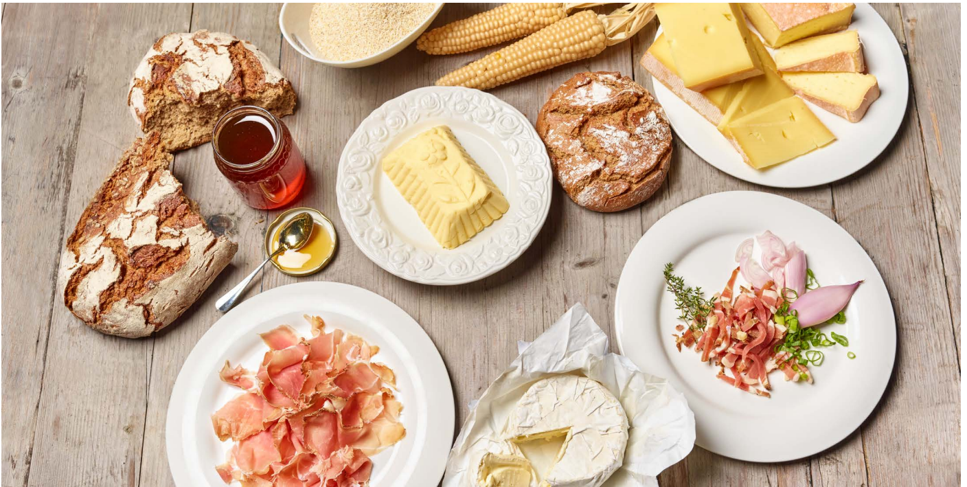
Slow Food Kärnten