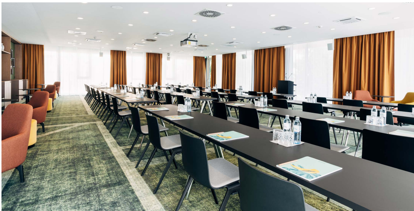
Hotel Galántha