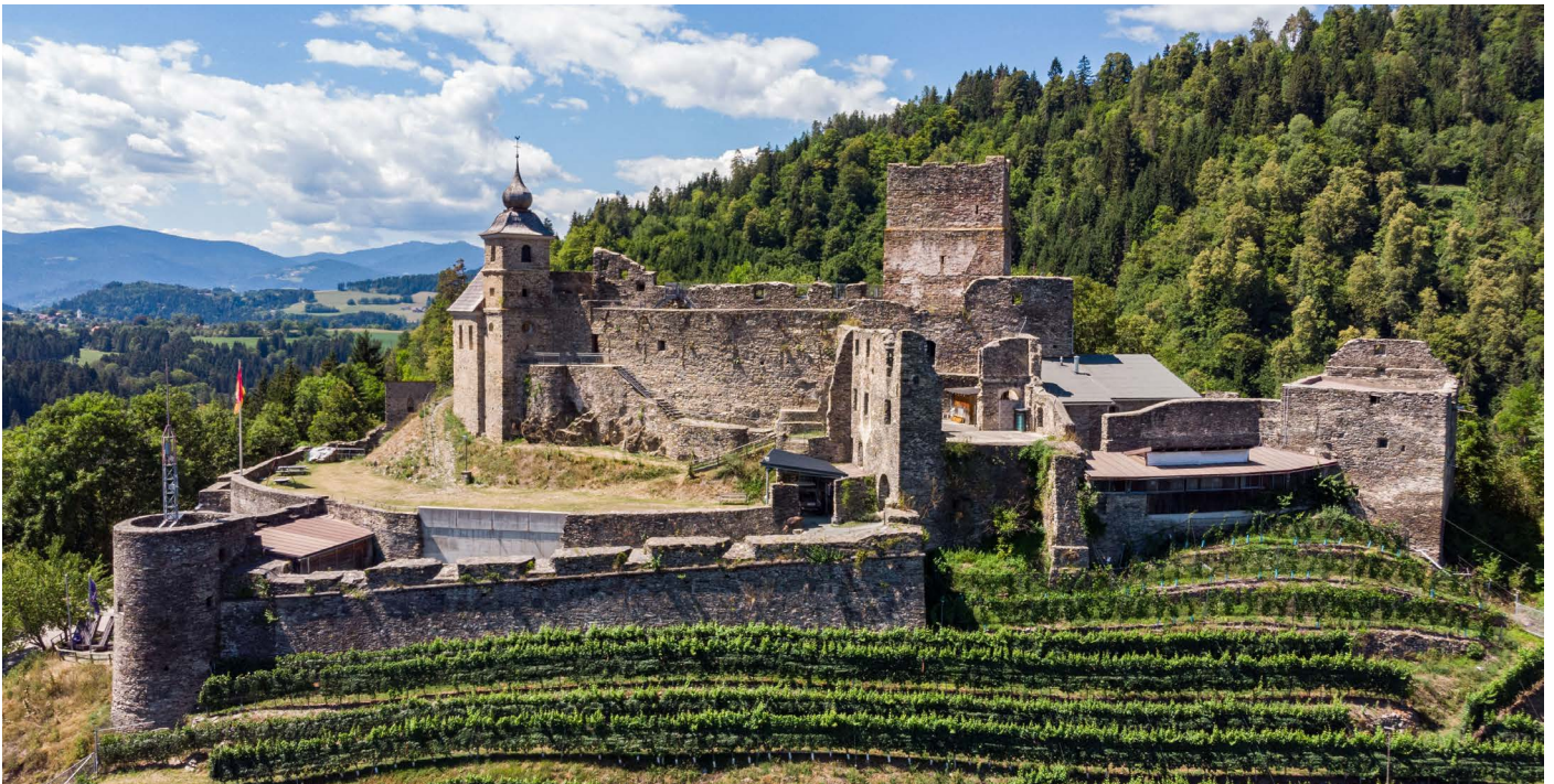
Burg Glanegg